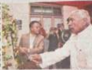
Governor Phagu Chauhan inaugurates a library of the KHADC on the Council's premises in Shillong on Tuesday.

all of us today as the KHADC has officially opened its library