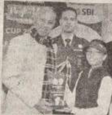
He also appreciated the organiz-

ers for promoting Shillong as a golfing destination, which enhances the state's tourism appeal.