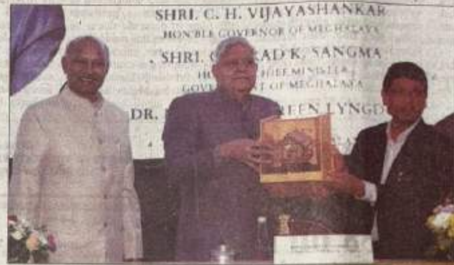
Vice President Jagdeep Dhankhar with Governor CH Vijayashankar and Chief Minister Conrad K Sangma during the virtual foundation stone laying ceremony of the Meghalaya Skill and Innovation Hub, at the State Convention Centre on Wednesday.

He also hoped that the state's human resources could get a boost with the establishment of the centre. "I am sure this is going to