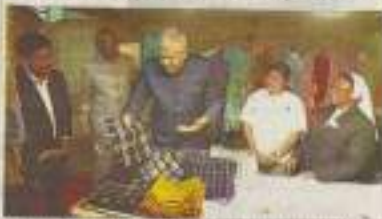
The Vice President Jagdeep Dhankar (right) laying the foundation stone of the government of Meghalaya's first skill hub at Shillong on Wednesday.

Dhankar lays foundation stone of skill hub