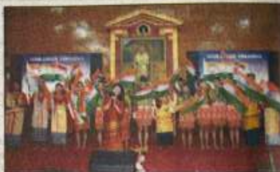
A local troupe performs at the launch of 'Har Ghar Tiranga' campaign at Raj Bhavan on Tuesday.

knowledgeed Meghalaya's contributions to India's freedom struggle, mentioning notable state freedom fighters like U Tirot Sing Syiem, Kiang Nangbah, and Pa Togan