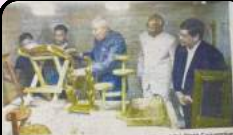
Vice President Jagdeep Dhankar visiting the Shillong Convention Centre on Wednesday.

He said that the skill hub is a landmark project for the state and will provide a platform for the youth to showcase their skills. He also said that the hub is a joint venture between the state government and the private sector, which is a model that can be replicated in other states. He emphasized the importance of skill development for the youth and said that the hub will provide training and skill development to the youth of the state. He also said that the hub is expected to create many jobs and provide a platform for the youth to showcase their skills. Dhankar, who is the Vice President of India, was in Meghalaya for a two-day visit. He will be attending various events and meetings during his visit. The inauguration ceremony was held in the presence of several dignitaries and officials. Dhankar, who is a member of the Bharatiya Janata Party, is a well-known figure in Indian politics. He has held several important positions in the government, including Minister of Education and Minister of Skill Development. His visit to Meghalaya is part of his ongoing efforts to promote skill development and youth empowerment across the country.